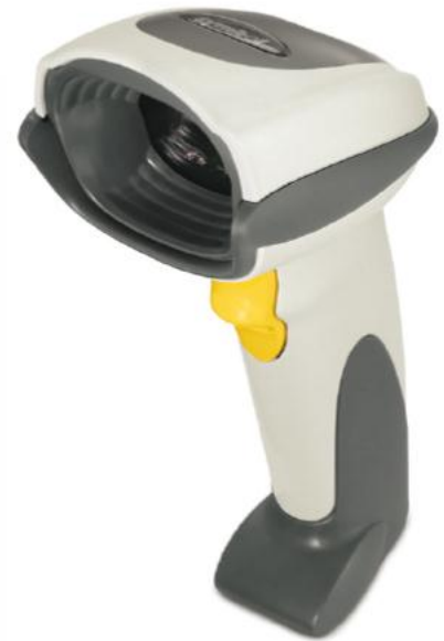
Motorola Symbol DS6707 Digital Imager Scanner

This of course saves you plenty of time and both devices needed are always ready to hand and to use.